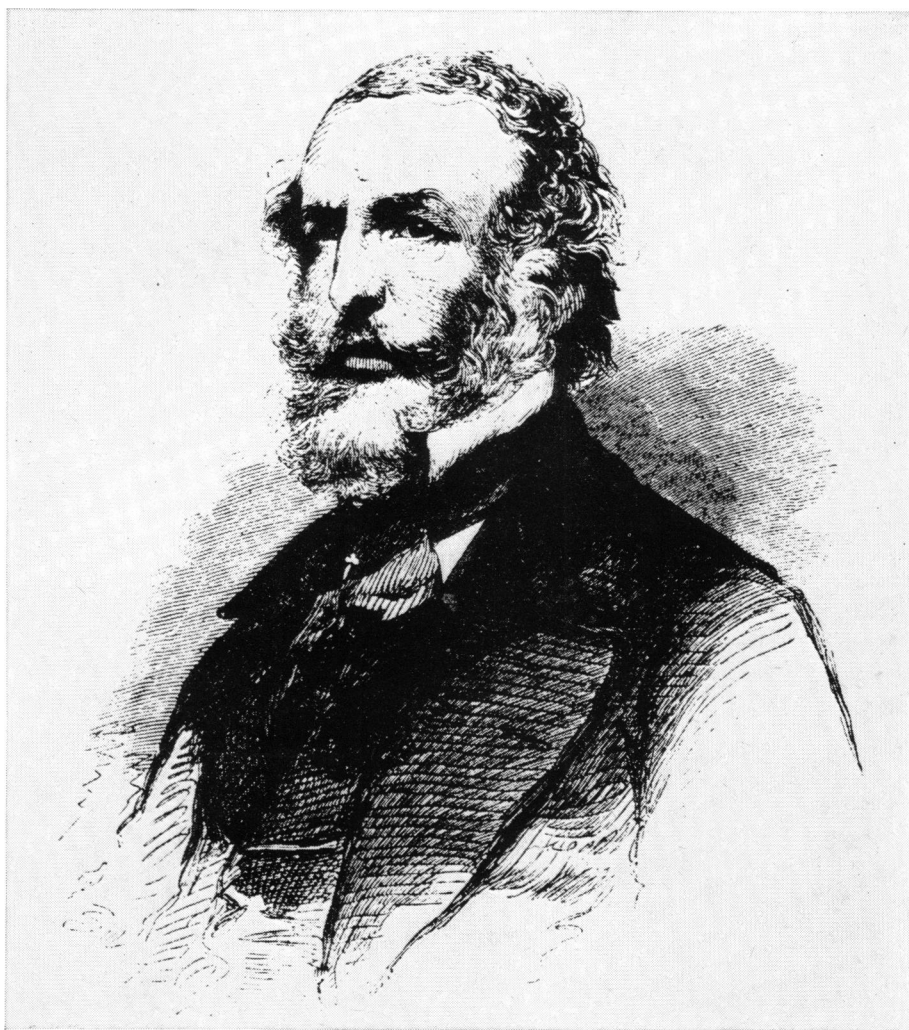
Figure 3. Portrait of John Rae. Woodcut from a photograph by Brady.